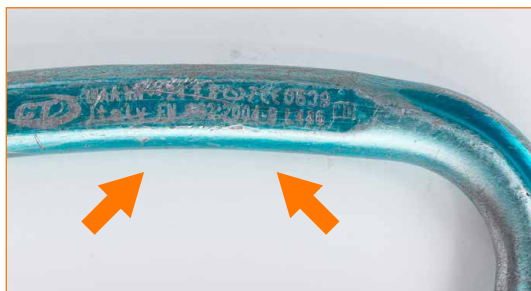
PHOTO APPENDIX CONNECTORS