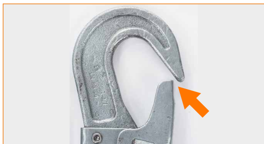
PHOTO APPENDIX CONNECTORS